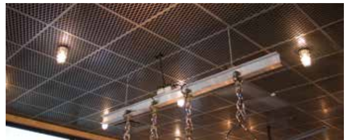
▲ Metal grid ceiling panels with I-beam light fixture made from upcycled meat hooks.