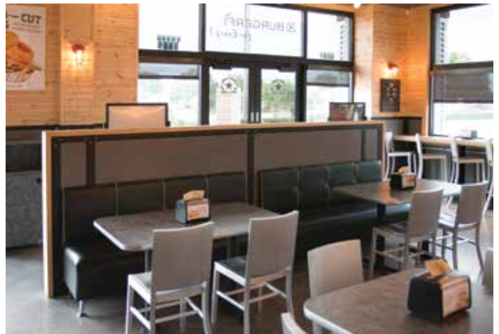
▲ Renewable sourced wood panel walls, recycled aluminum chairs, and LED lighting make this an eco-friendly restaurant.