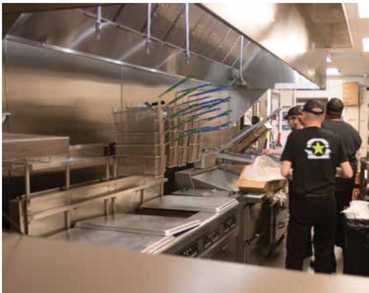
▲ Morning prep before another busy day in the new stainless steel kitchen with grills, fryers and ventilation hoods.