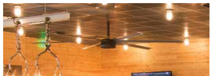
▲ The 10' ceiling fan provides efficient air movement and uses 66% less energy.