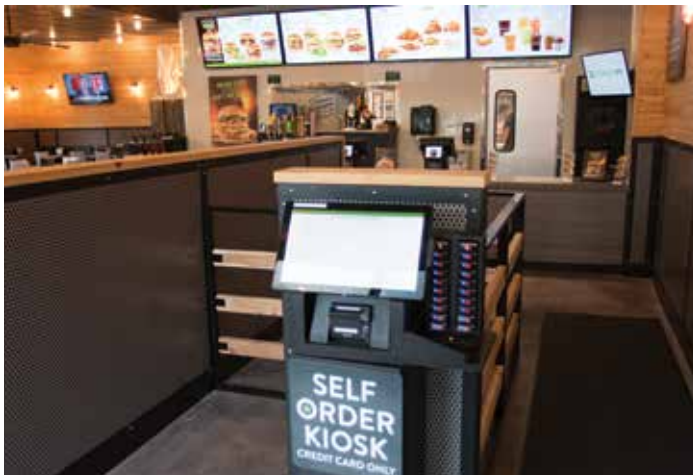
▲ Self-serve ordering kiosk adds speed and efficiency to the process.