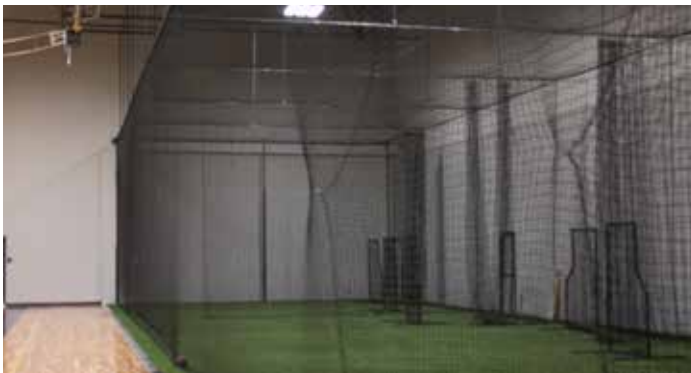
▲ Bating cages that double as pitching or throwing lanes.