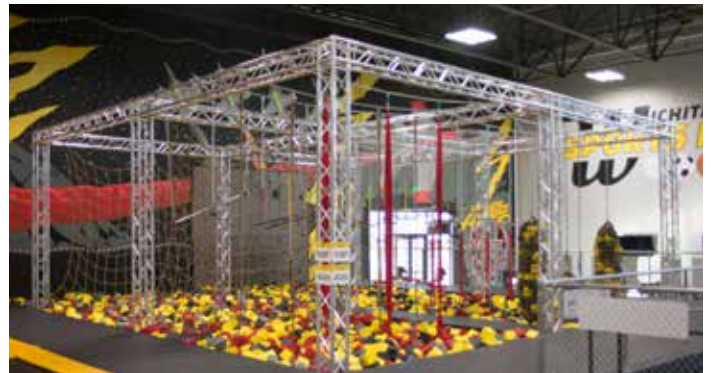
▲ Obstacle course