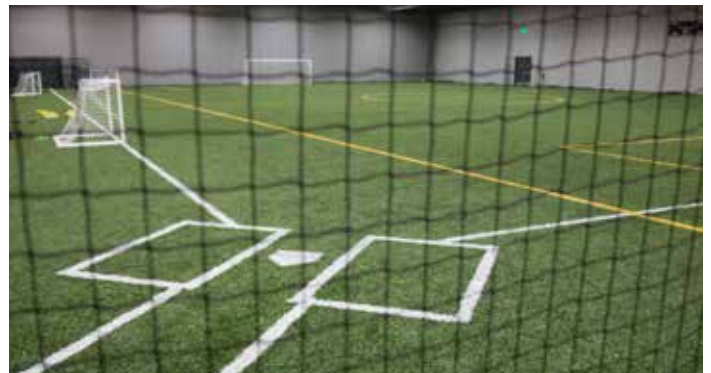
▲ Baseball infield and soccer field area.