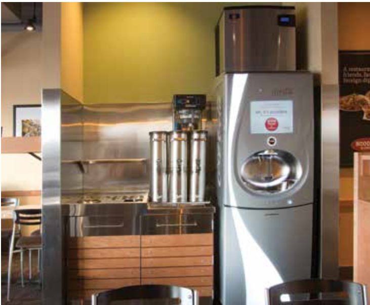
◀ Drink Station