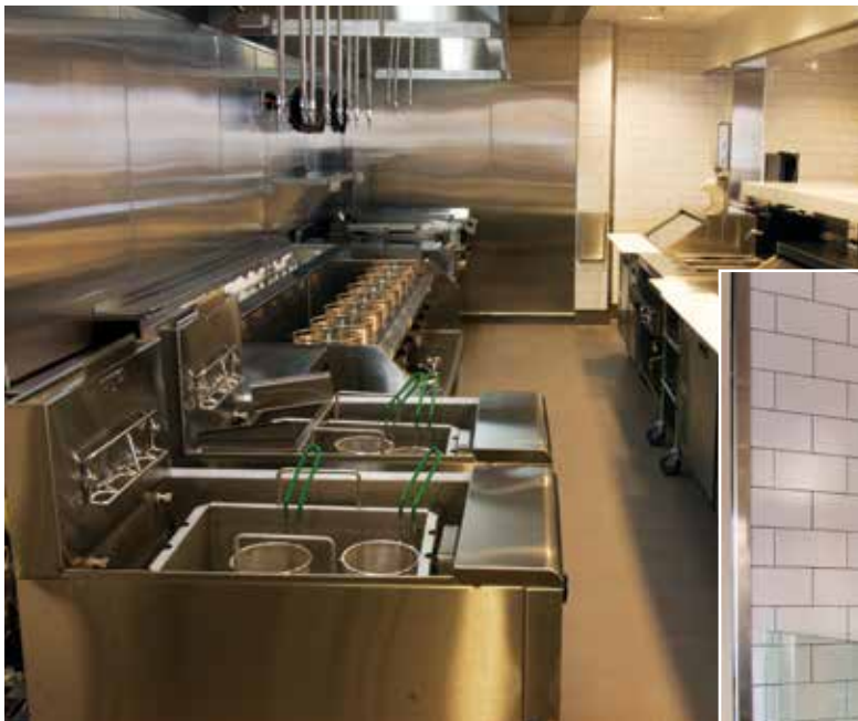
▲ Cookline and prep elements