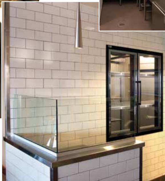
Walk-in cooler and prep station ▶