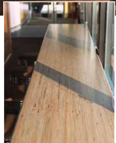
▲ Additional bar style seating