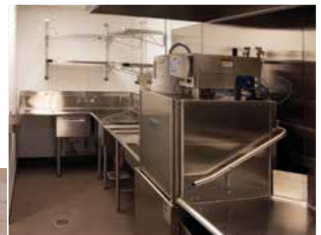
▲ Back-of-house dishwasher station